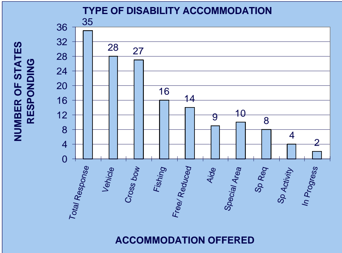
Frequently reported accommodations provided TABLE 2

[See Appendix G: Key for Explanation of Table and Chart Column Titles]