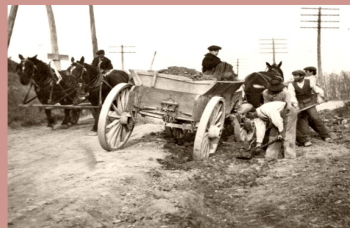
1915 Road repair, Rt 1

MARA is a domestic non-profit organization