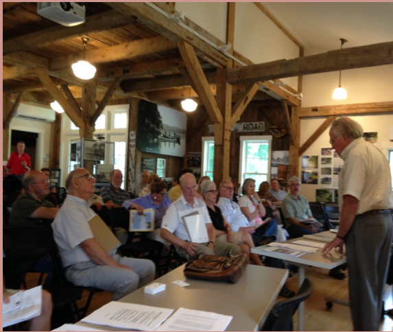
Attentive listeners at a MARA conference